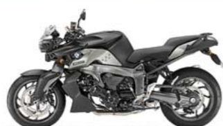
Black Silk Gloss/Granite Grey Matt Metallic