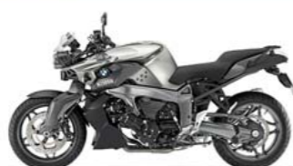
Light Grey Metallic

For more information, visit bmw-motorrad.com