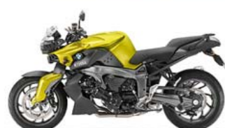
Acid Green Metallic/Black Silk Gloss